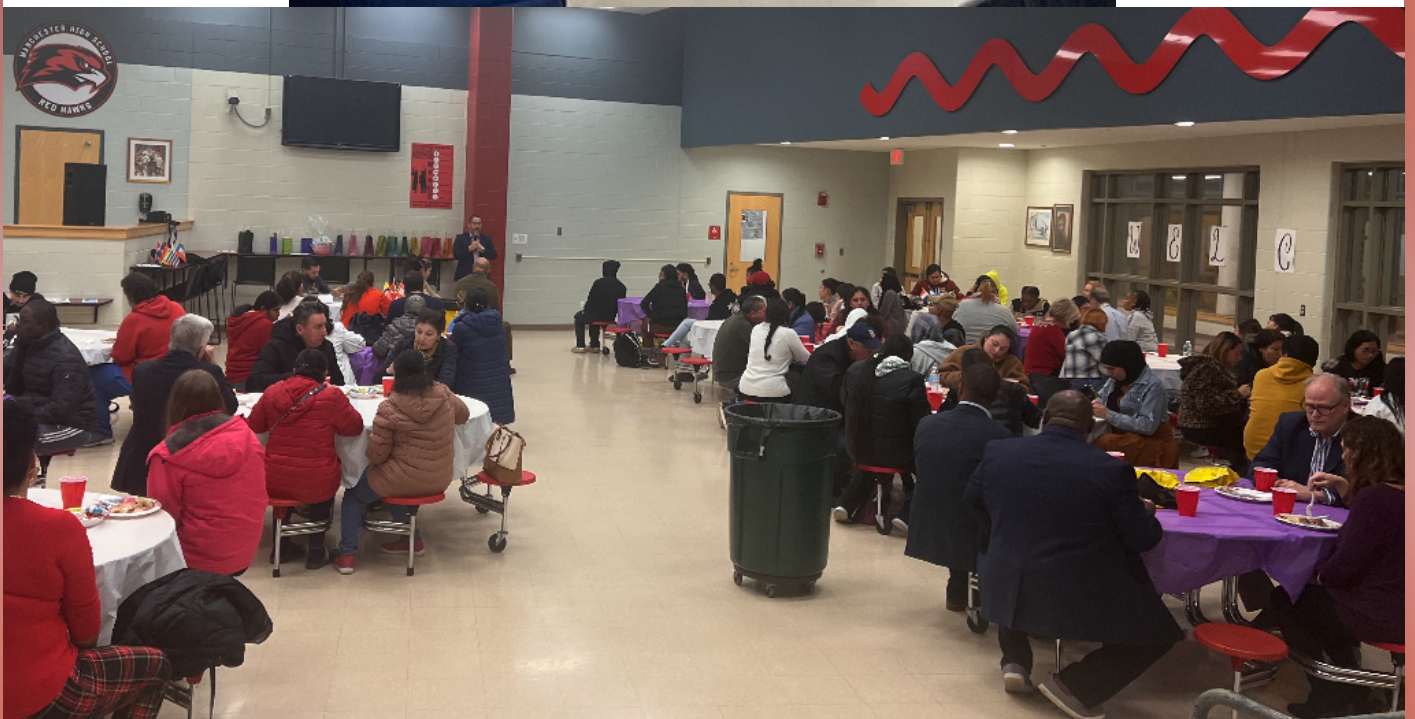
Spirit Week Celebrations