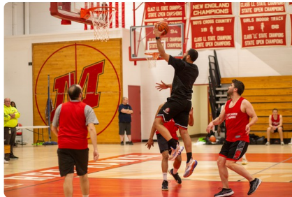
Through the Lane for 2