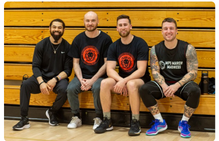
The Mane Event